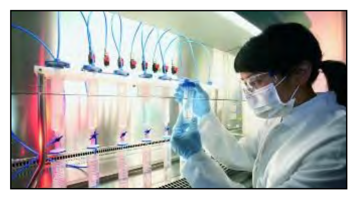
Hydra Cobra Antiviral Disinfectant Concentrate is a broad-spectrum, disinfectant.

Which kills a wide range of viruses and bacteria, including MRSA, E. Coli, and C. Diff. Prevents common viruses like the flu, Covid-19 and cold from spreading.