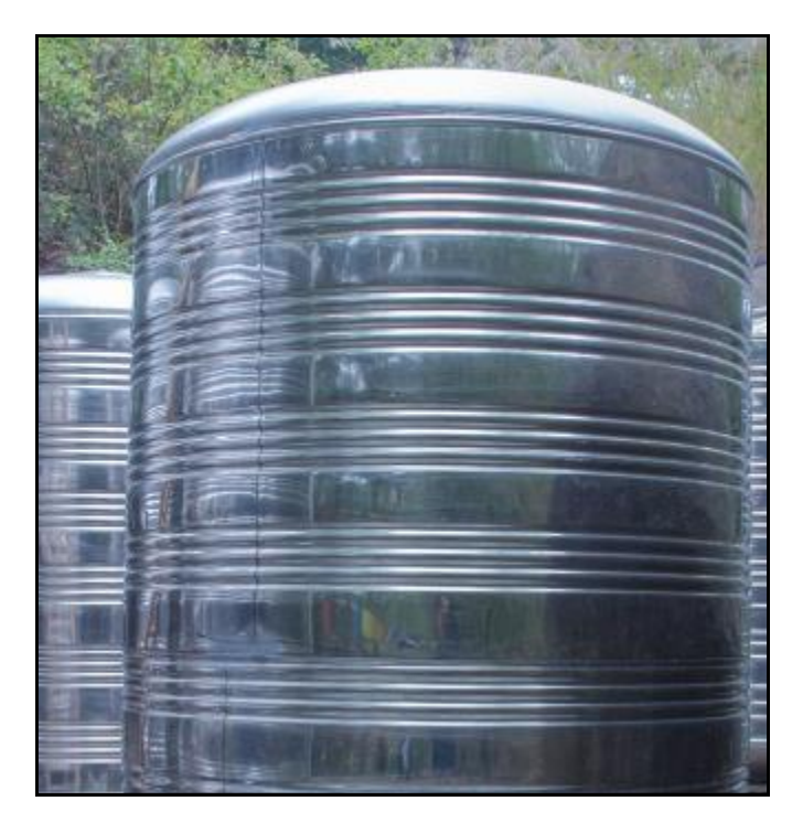
Algae Free/HD is safe to be left in the processor. No need to drain before use.

Stops stabilizers and static tank water from degrading. Keeps wash water or stabilizer solutions crystal clean 24/7.