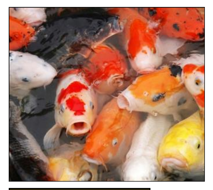
Unlike other zeolites, Hydra Ammonia Lock is of the highest grade and not mixed with cheap impurities.

Once soaked with ammonia , the zeolites are taken out from the pond to be cleaned-out and recharged. The ammonia adsorbed on the zeolites is expelled by immersion in salt water solution. The ammonia is then released in exchange for the salt. Due to this property, zeolites are not suitable for use in salty waters.