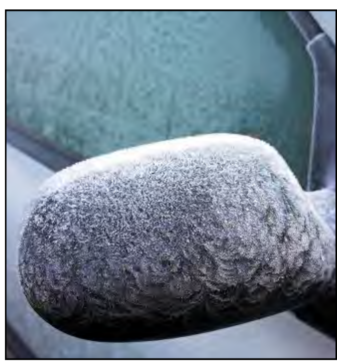
It dissolves ice and snow quickly when applied onto frozen windscreens, headlights, side mirrors and windows without damaging paintwork, rubber or plastic.

Arctic Windscreen De-icer can be used to prevent your windscreen freezing in the first place when applied the night before as well as a powerful de-icer to deice your car after ice has formed.