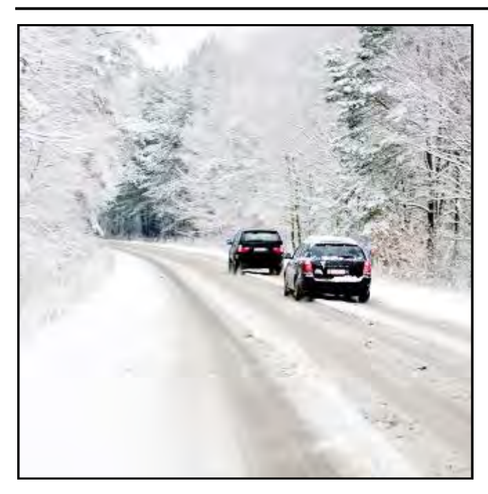
Hydra's Arctic Windscreen Wash is the premium windscreen wash additive option for use in winter.

Ideal for use in all makes of vehicles and vans. Its unique alcohol blend protects against re-freezing 24/7 and will work down to −40°C.