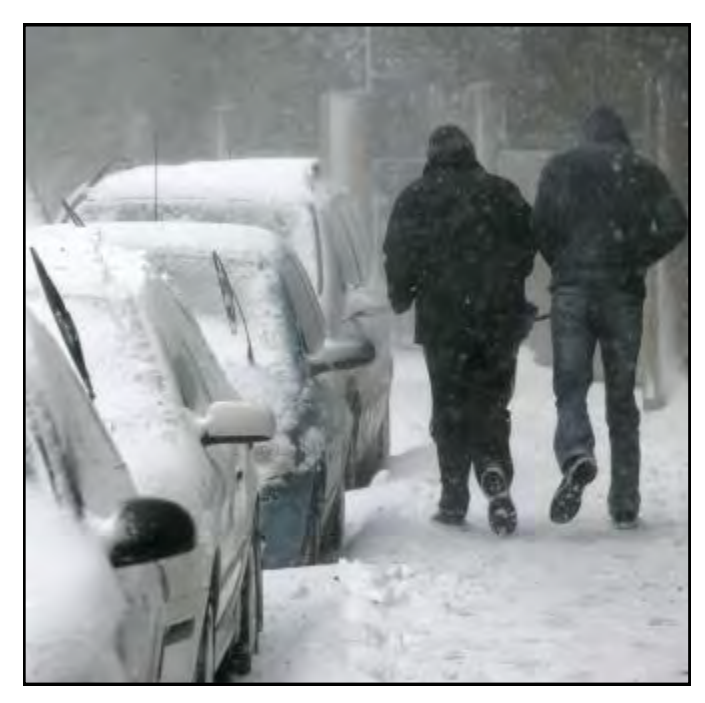
Arctic Windscreen Wash is a concentrated wash fluid additive that you simply add to your washer fluid reservoir.

The powerful formulation has dual action that protects washer lines & nozzles from freezing as well as removing dirt, traffic grime and salt from windscreens leaving them sparkling clear when visibility is most crucial.