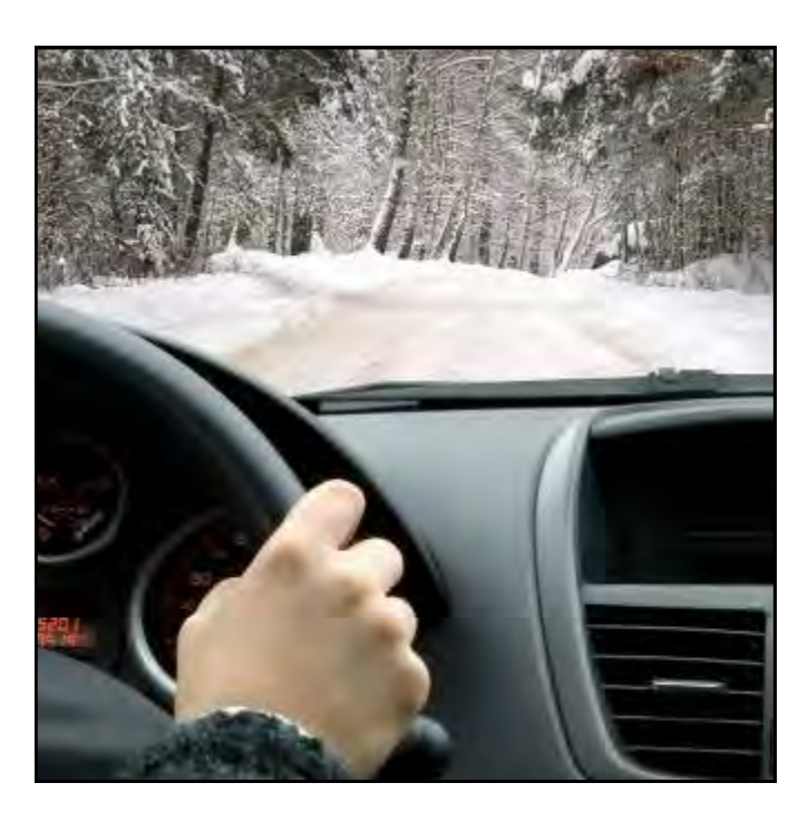
Hydra Arctic Windscreen Wash's exceptional cleaning power leaves a crystal-clear, non-smear finish to all windscreens.

Available in a range of sizes and refills, there is a bottle to suit all requirements.