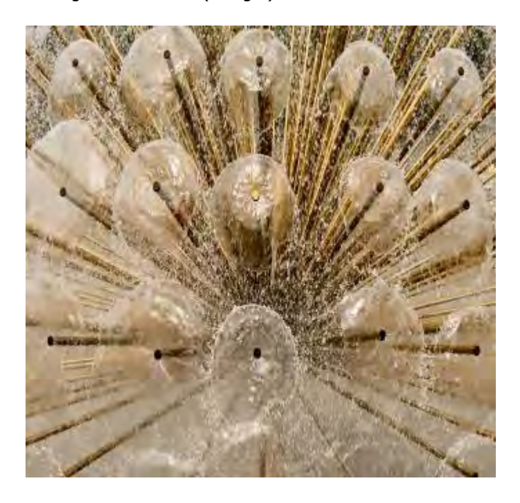
METHOD OF USE

Dilute Hydra Copper Clean with 1:10 to 1:20 parts of water